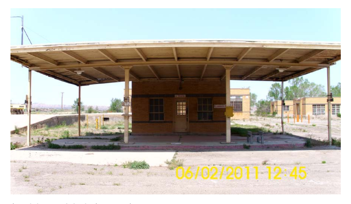
Figure 9. Structure 6. Gas Station. Front View.