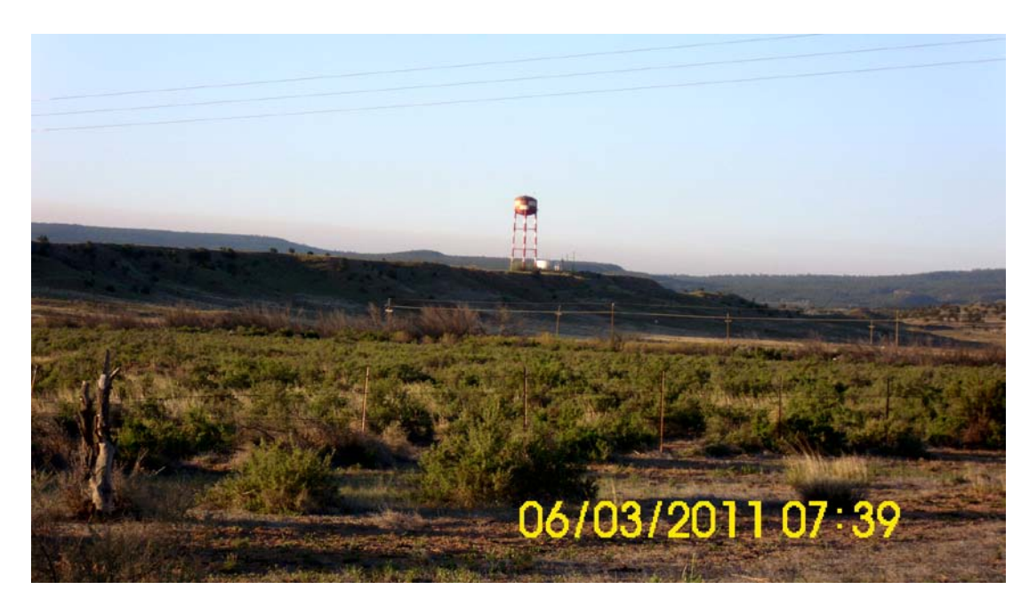
Figure 1. Structure 53. Distant View from I 40.