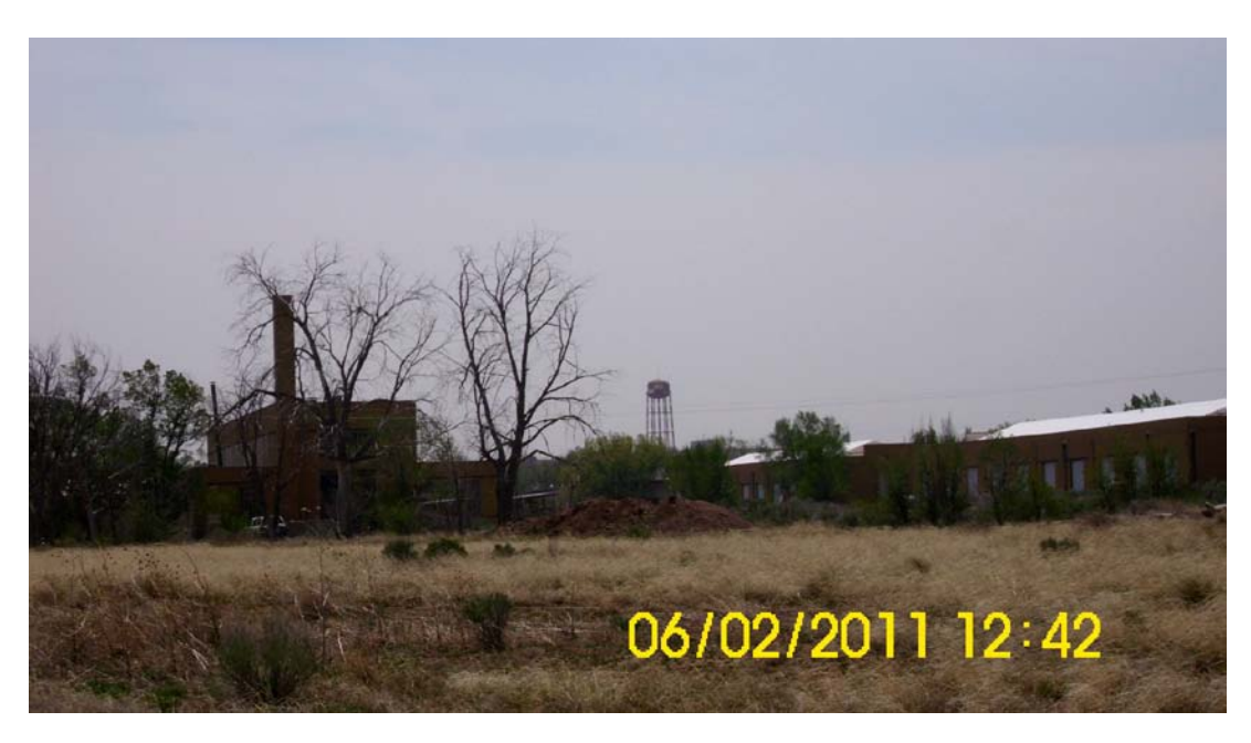
Figure 2. Structure 53. Distant View from Administration Area.