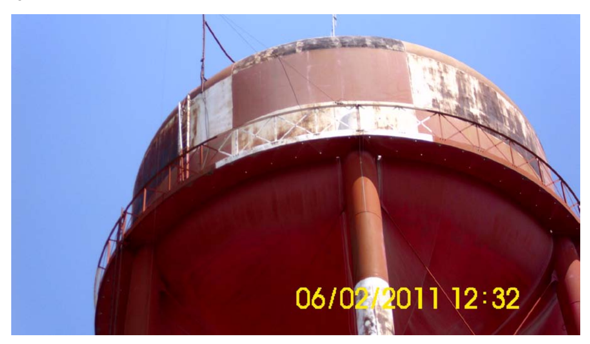
Figure 7. Structure 53. Water Tank Detail.