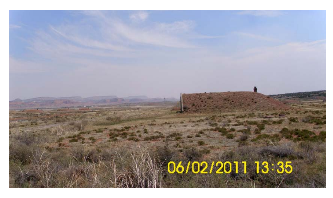
Figure 3. Structure 53. Distant View from Magazine Area.