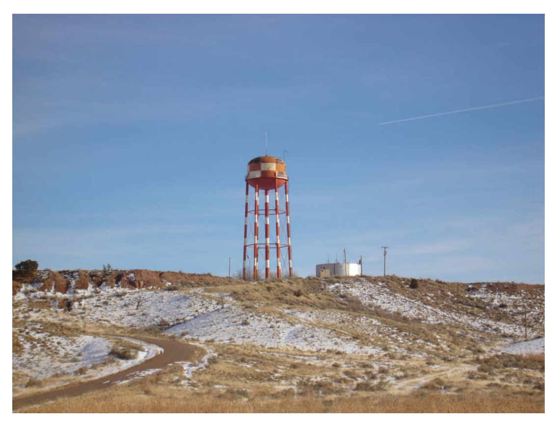
Figure 4. Structures 53 (left) and 46 (right).