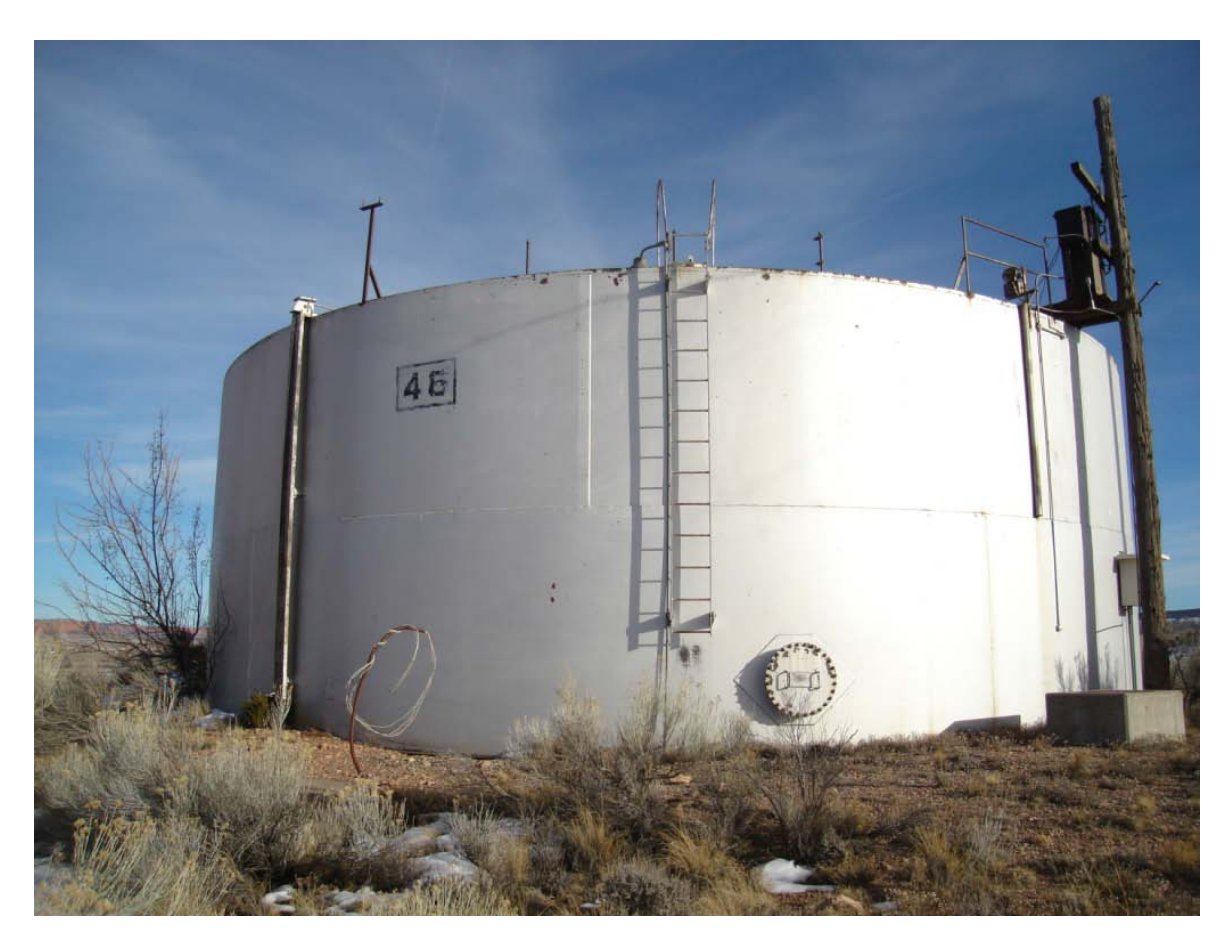
Figure 6. Structure 46. Water Tank.