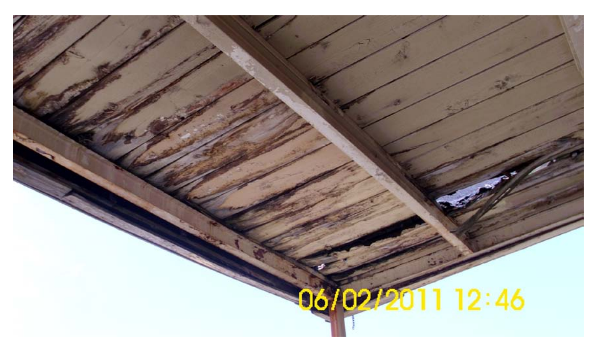
Figure 13. Structure 6. Gas Station Canopy Detail.